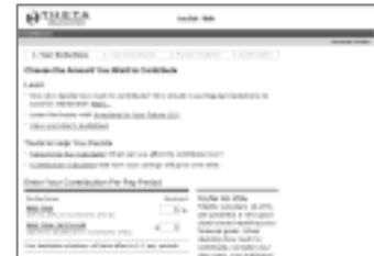
For illustrative purposes only.

Enter contribution amount and then click "Continue".